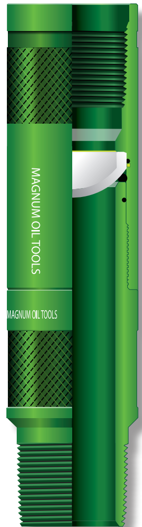
Mule Shoe with Wireline Re-Entry Guide